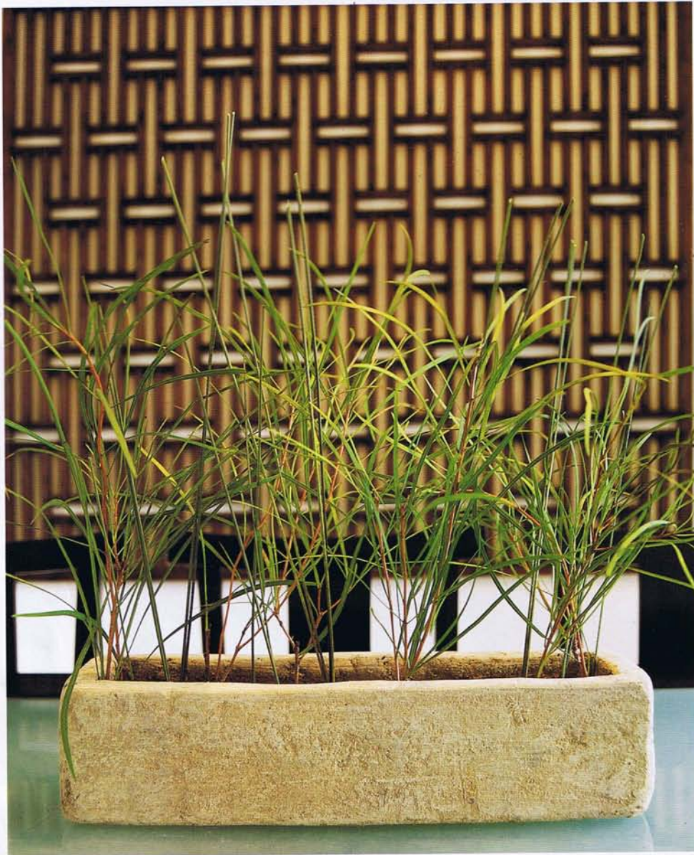
The Chinese screen is from Artemis. 中國屏風購自Artemis。

如 果你認為黑與白已不時興，現在應該再作考慮。此間半山單身人士寓所，完全證實不用顏色進行裝飾同樣達致時尚效果，由 Skia Design 設計的時尚單色家居，提供鮮明簡約的戲劇性觀感，顏色絲毫沒有起作用。