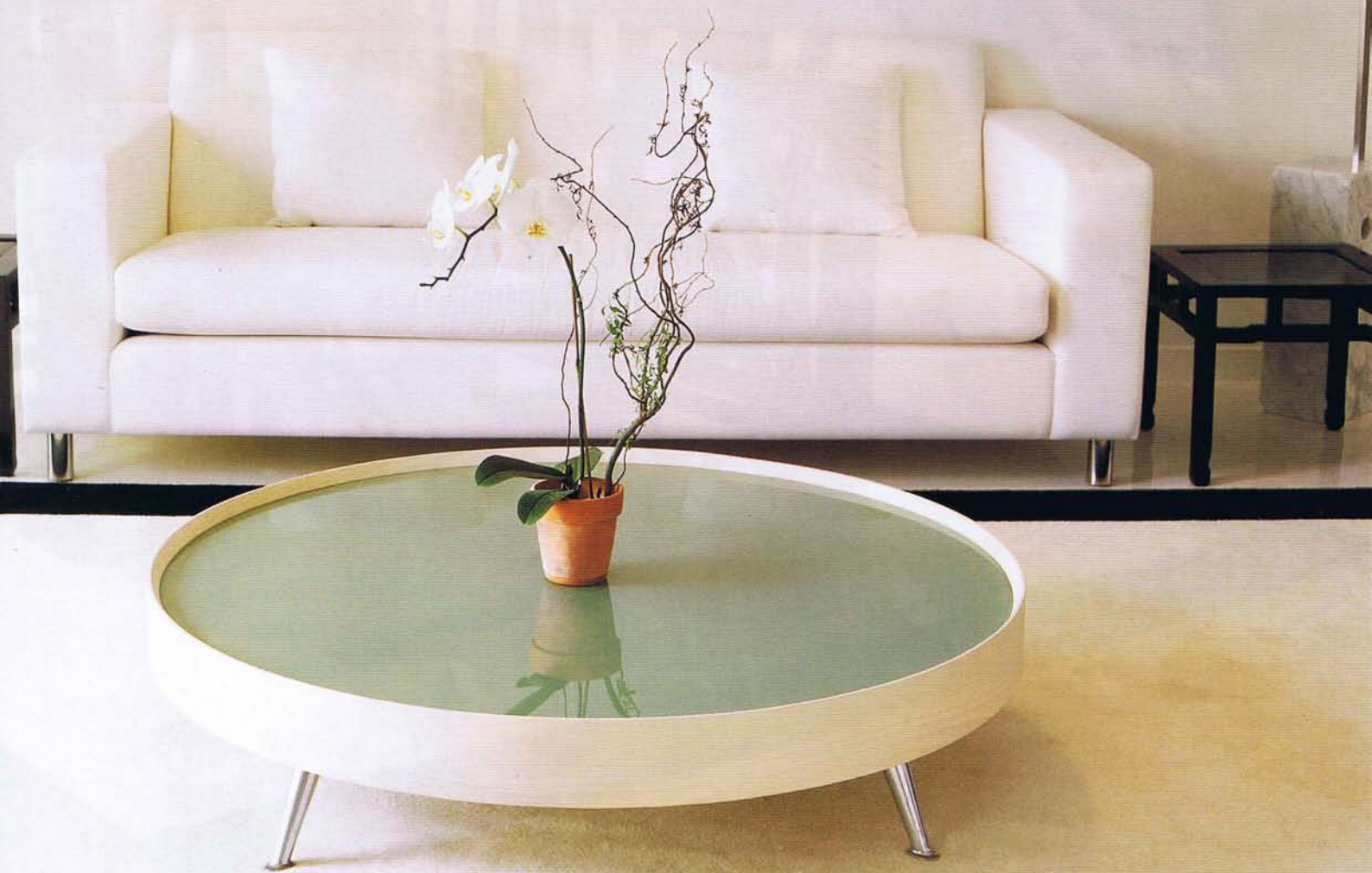
The semi-translucent table gives a touch of fluidity to the scheme. The Italian chrome lamp was designed by William Artists. 半透明桌子增添流麗感。意大利鍍鉻燈飾由William Artists設計。