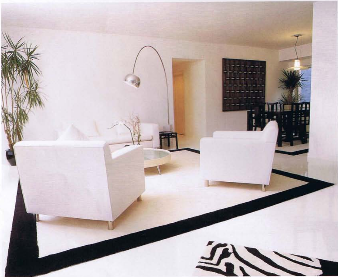
Fresh white and near-black furnishings make for some striking contrasts. 白色和近似黑色的裝飾，形成鮮明對比。