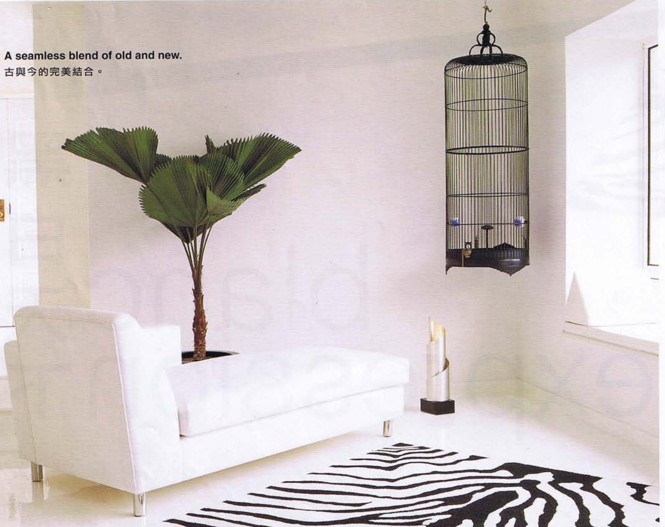
A seamless blend of old and new. 古與今的完美結合。