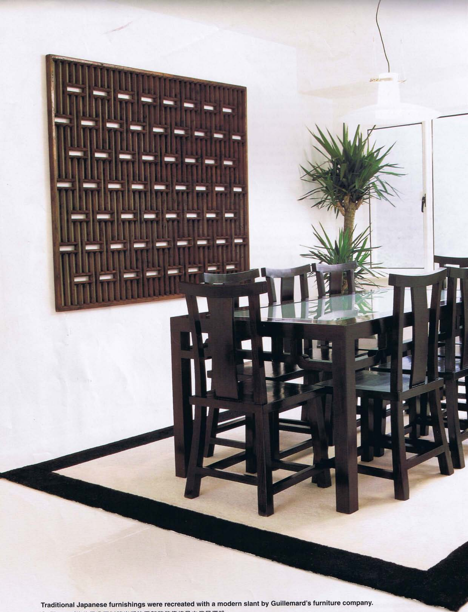
Traditional Japanese furnishings were recreated with a modern slant by Guillemard's furniture company. Guillemard的傢具公司以時尚手法重新裝飾傳統日本傢具擺設。